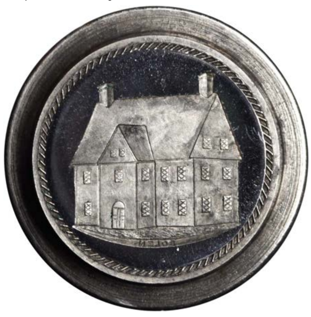
1881 Pynchon House Medal - Original Obverse Die